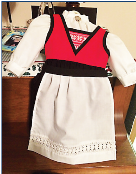
A little girl Scandinavian outfit shown by one of our members

It is very quiet these days at our Lodge. We are looking forward to May 17th supper and social, and in June our picnic. Our April meeting was very small in numbers, but we did get some business taken care of. Our yearly fundraiser, a raffle,