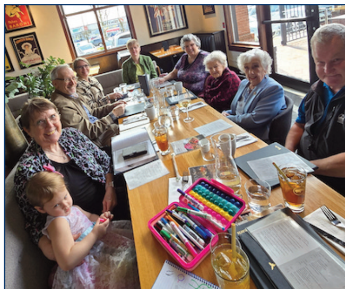
Most of Varden Lodge officers gathered for a thank you brunch in March.

Sadly, we had to cancel our Easter Egg hunt but we are going to take part in several events during the late spring and summer. We plan