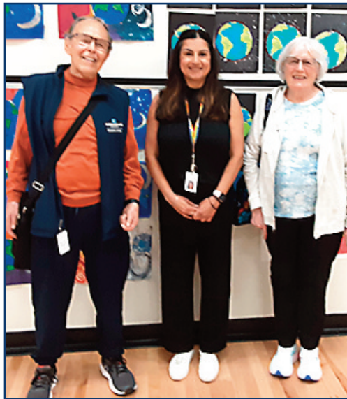
Hjorth Rd. School Art Exhibit with Principal (centre) & Viking Lodge members