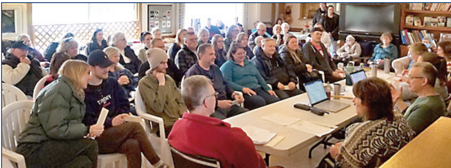
A big turn out at Sleipner's Spring Leaseholder's meeting.

Western Weekend Sept. 13. Line Dancing Les-